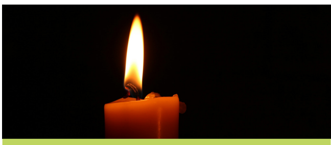
Sale | Grassby and Sons Ltd Sale of Grassby and Sons Ltd to a subsidiary of Pulford Trading Ltd, an investment vehicle managed by Downing LLP